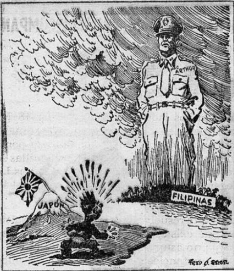
Setbel en el Richmond Times-Dispatch.