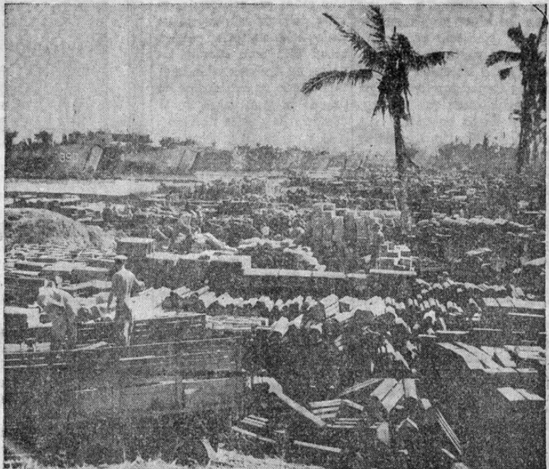
Barcos de la marina de los Estados Unidos, atracados en una playa de Leyte, Filipinas, desembarcan millares de toneladas de material de guerra para desalojar a los japoneses del archipiélago. El material necesario para esta campaña, que se desarrolla a 7,000 millas de distancia, hace escasear en los Estados Unidos los artículos de consumo civil.

La directiva del Club Miramar está organizando un baile para el 31 de Diciembre con el objeto de inaugurar el nuevo edificio que se está construyendo para nuestro Centro Social. La nueva cantina que está por terminar se será instalada con toda clase de comodidades y no tendrá nada que envidiar a la mejor cantina de San José. La fiesta que se prepara será una de las más suntuosas que se hayan proyectado y esperamos que resulte tal como sus organizadores piensan.