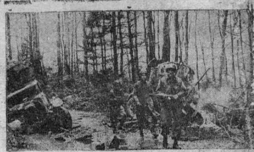
Una patrulla de los Estados Unidos avanza a través de un bosque en el frente occidental y deja atrás los restos de vehículos alemanes, inutilizados en la ofensiva invernal, que se desarrola con creciente intensidad hacia el corazón de Alemania.

The most important aspect of the operation was its tactical timeliness. For it reinforced those Partisans who were in the path of the Germans trapped, or almost trapped, in Yugoslavia and anxious, above all else, to keep their line of retreat open.